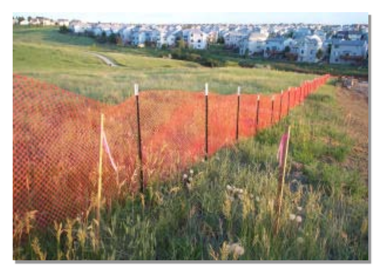
Photograph CF-1. A construction fence helps delineate areas where existing vegetation is being protected.

A construction fence can be used to delineate the site perimeter and locations within the site where access is restricted to protect natural resources such as wetlands, waterbodies, trees, and other natural areas of the site that should not be disturbed.